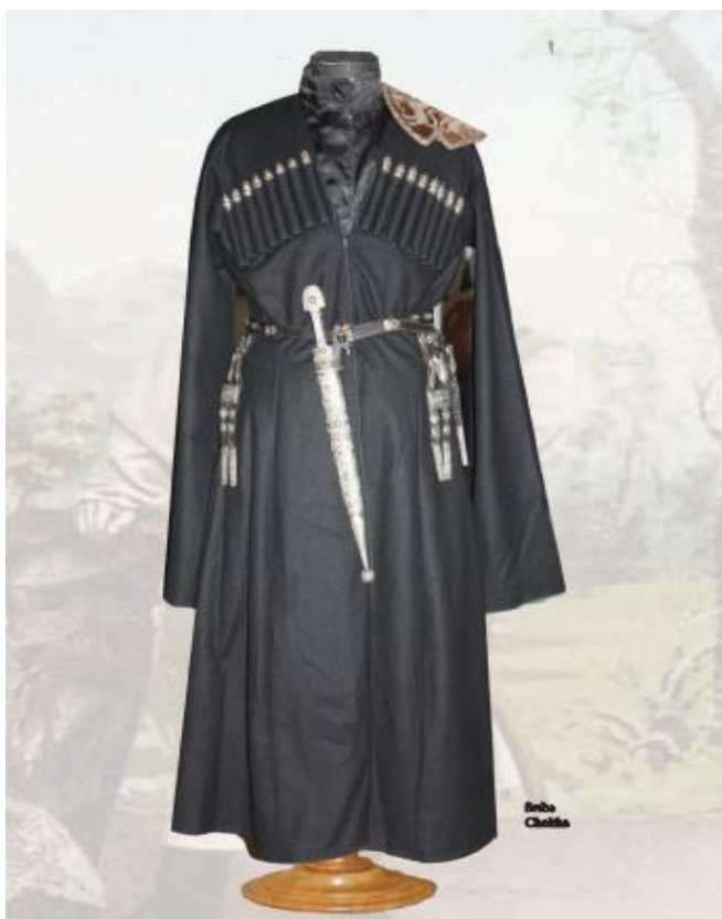
Figure 2: Chokha.