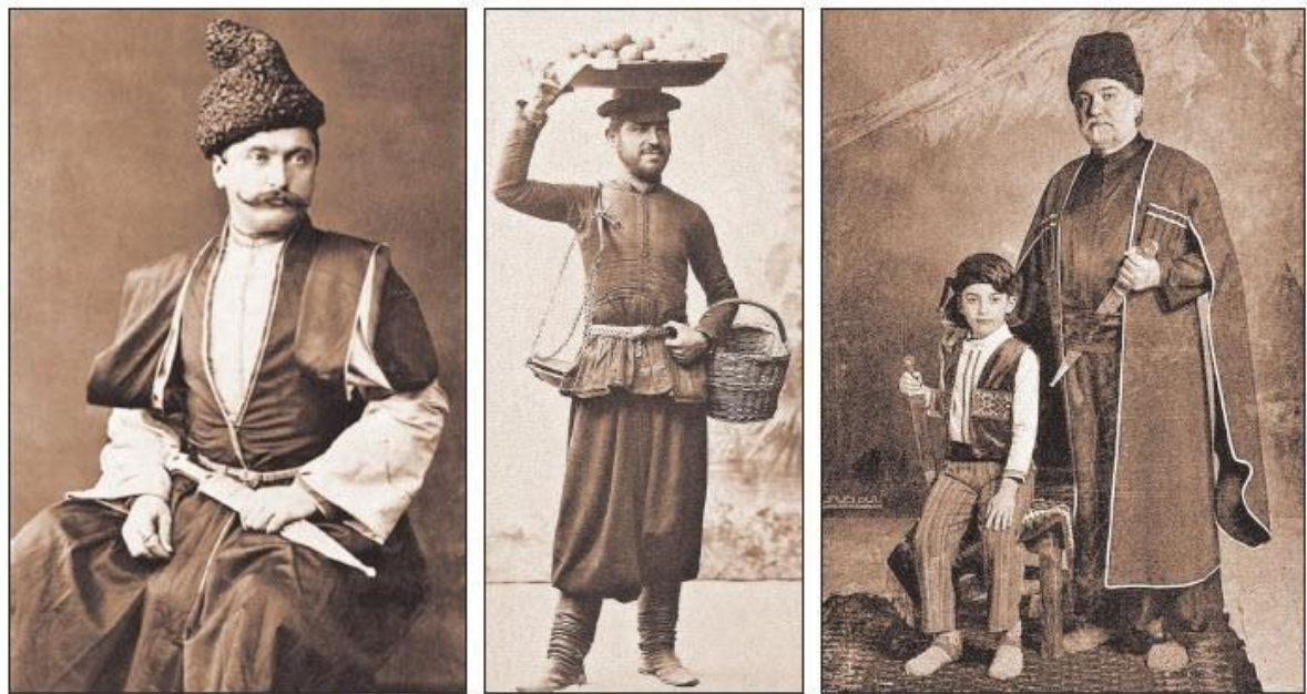
Армяне в национальной одежде. Конец XIX – начало XX в.