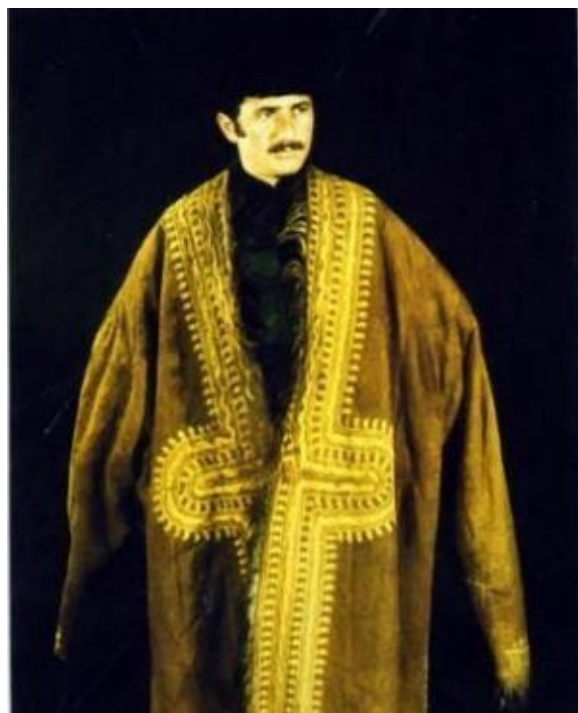
Figure 5: Kaval fur. Source: S.Dunyamaliyeva-Artistic and decorative features of