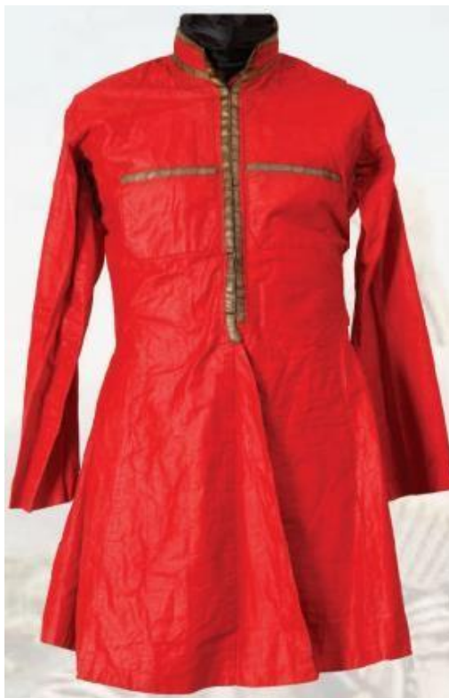
Figure 3; Akhalukhi.