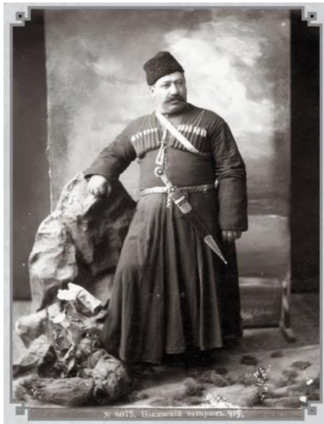
Figure 1: Baku Tatars.