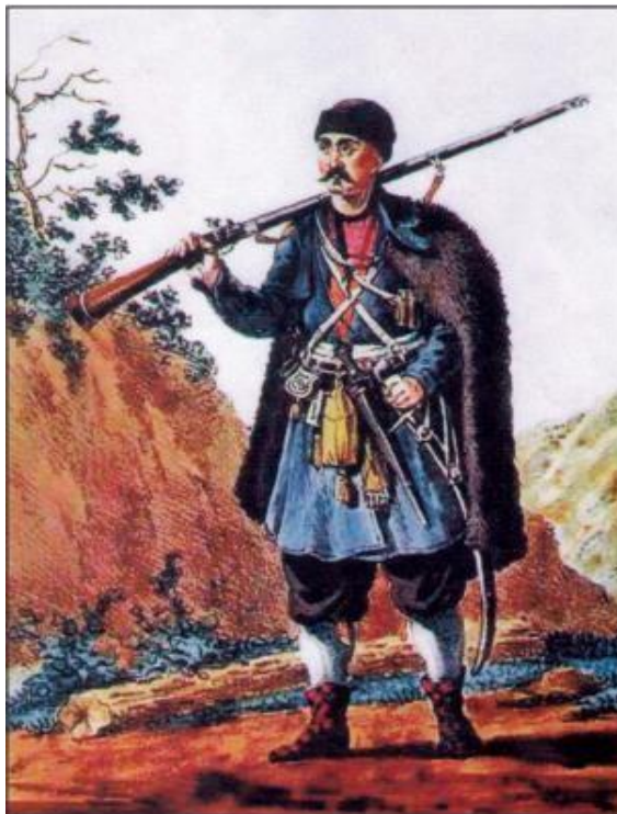
Figure 1: Tushetia. Source: National Dresses of The Caucasian Peoples In The Creation of The Artist-lithographer K.P. Beggrov