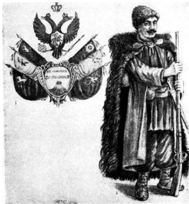
Figure 3: 19th century Armenian volunteer soldier and flag.