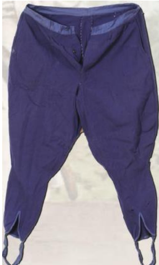
Figure 4: Trousers. Source: N.Dolidze, et al.- Illustrated Reference Book of Georgian National Clothing