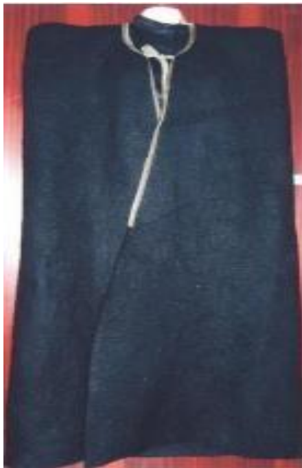
Figure 6: Yapinji.