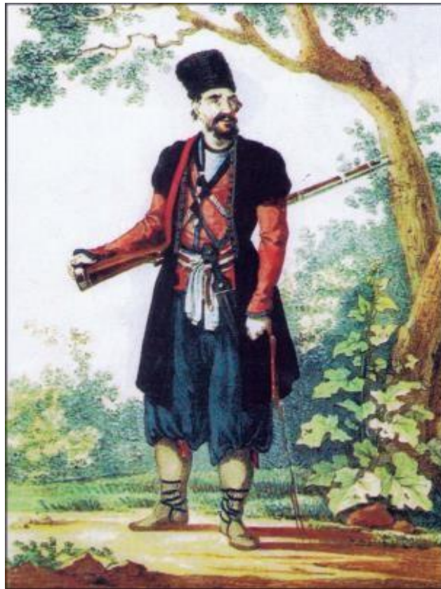
Figure 2: Kazakh. Source: National Dresses of The Caucasian Peoples In The Creation of The Artist-lithographer K.P. Beggrov