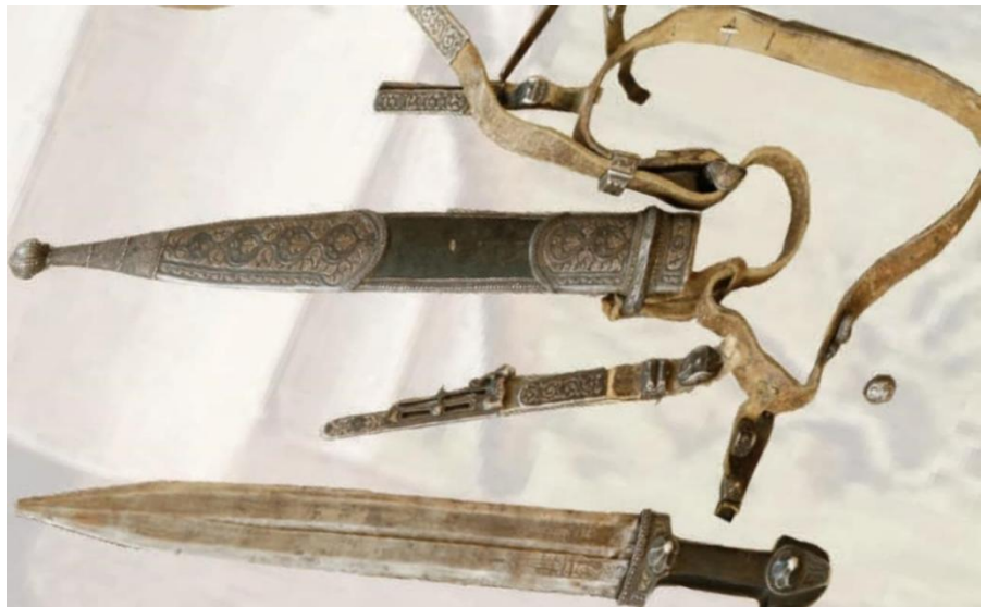
Figure 5: Belt and Sword. Source: N.Dolidze, et al.- Illustrated Reference Book of Georgian National Clothing