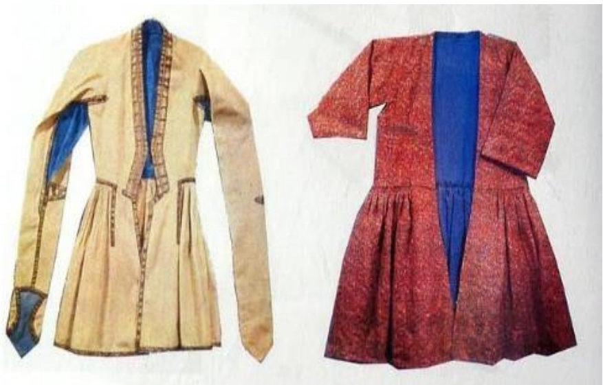
Figure 3: Baku-related chukha. Source: S.Dunyamaliyeva-Artistic and decorative features of Azerbaijani clothing