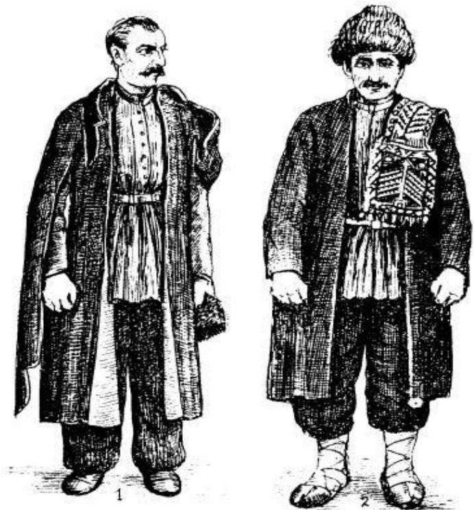
Figure 2: Chokha.